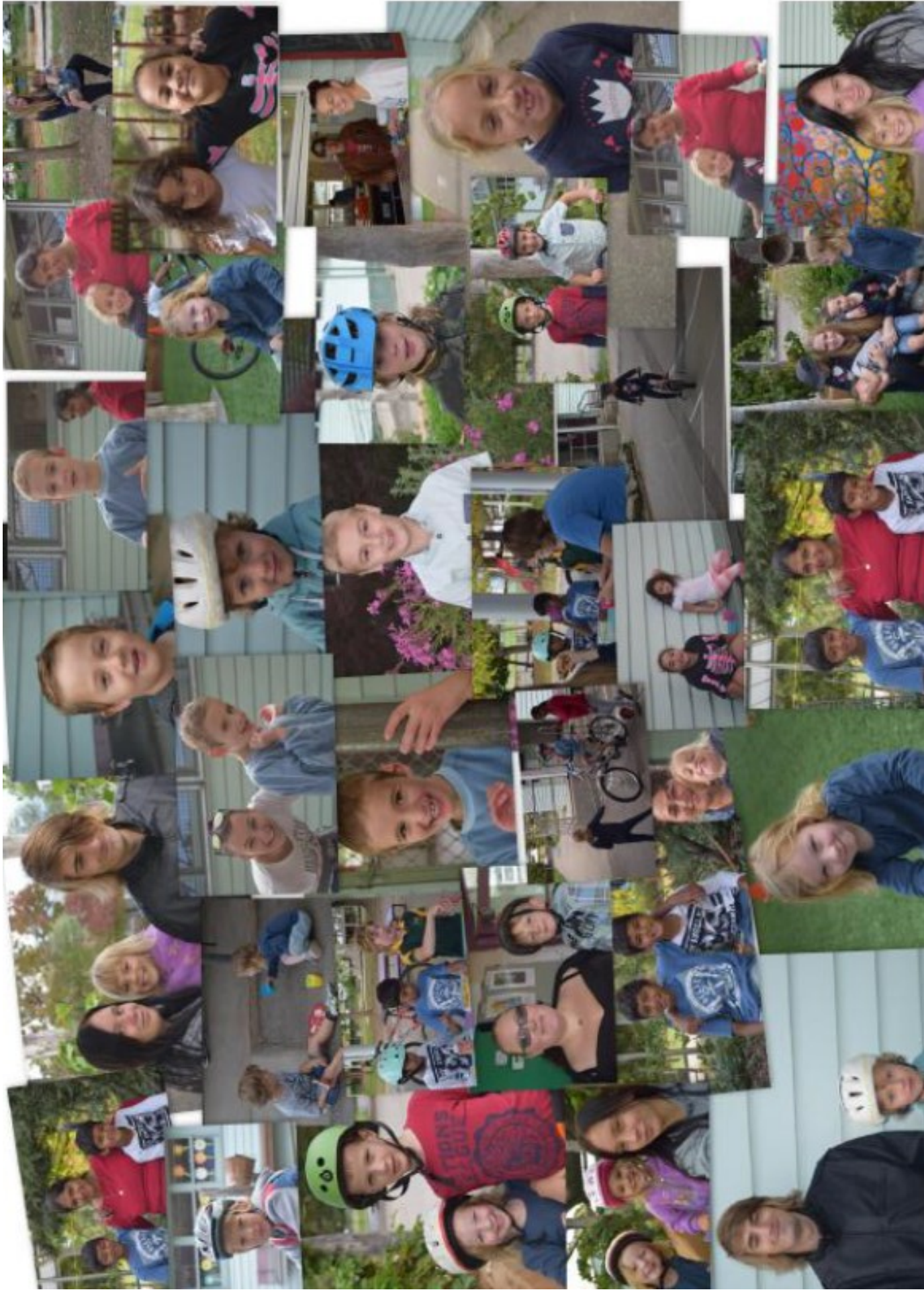
Lots of fun was had by all children and staff at OSHC Autumn Vacation Care 2016