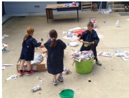
The Making group worked on constructing and decorating props for the Production.