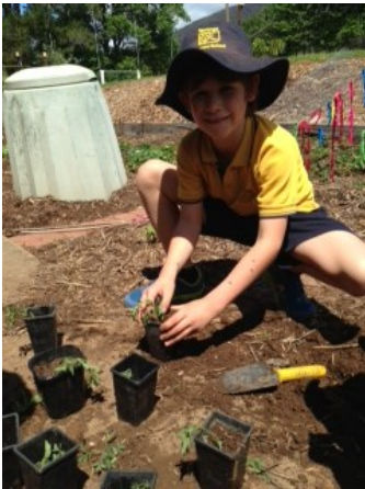
The gardening group transplanting tomato seedling and made a colourful bird scaring fence to protect our strawberries.