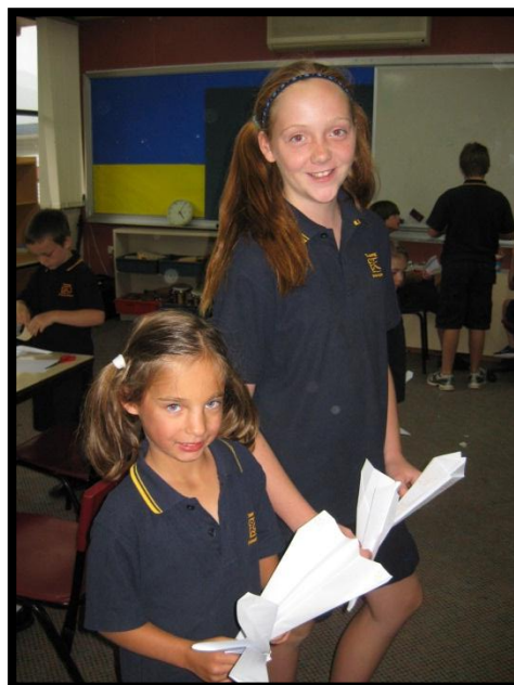
First of the Buddy Activity days