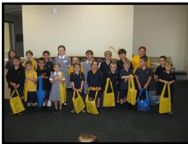
Preps receiving their Prep bags.

Parent/Teacher meetings Tuesday 19 th February 1-5pm. Time has been set aside for you to meet with your child's teacher to discuss their individual needs. Please fill in the form attached with your preferred availability. If you are unable to make it during this time please discuss alternative arrangements with your child's teacher.