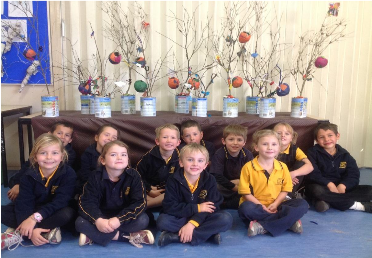
Artwork based on 'The Very Hungry Caterpillar'. (Cocoons)